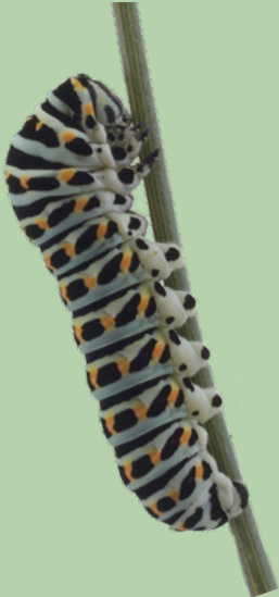
Three weeks old