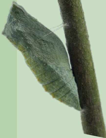
Four weeks old