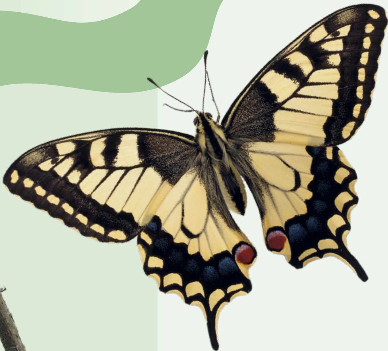
Seven weeks old