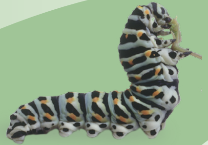
Two weeks old