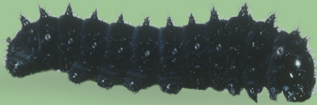
One week old