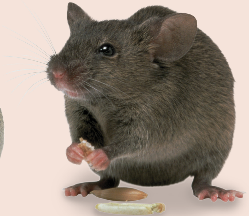
Eight weeks old