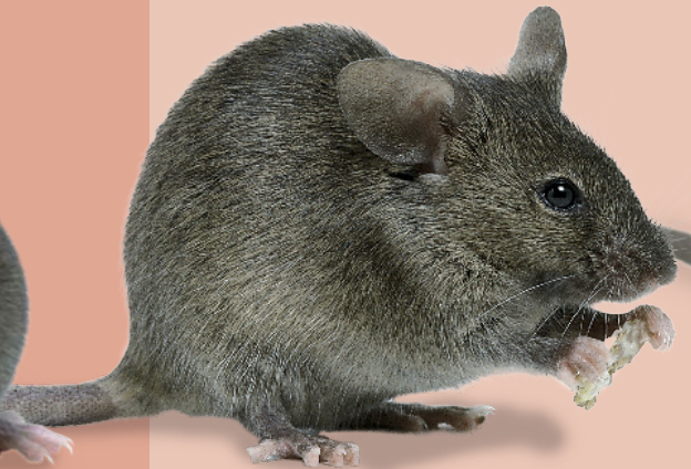
Four weeks old