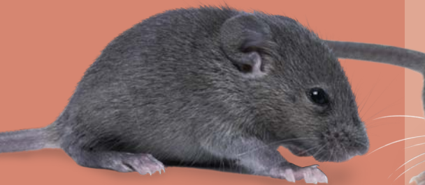
Two weeks old