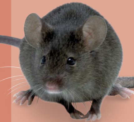
Three weeks old