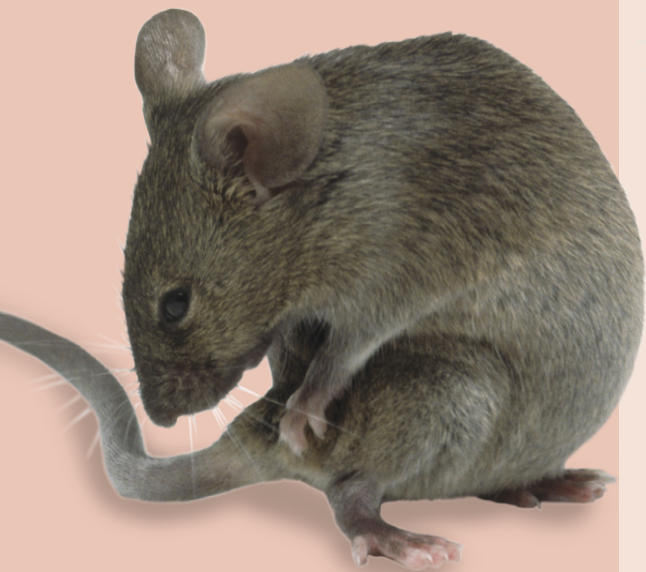
Six weeks old