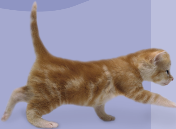
Four weeks old