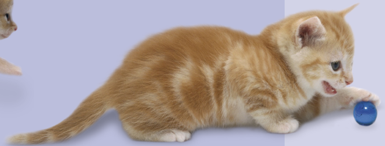
Six weeks old