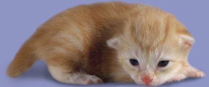
Two weeks old