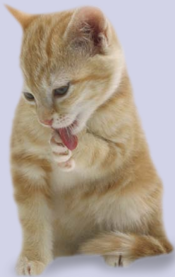
Eight weeks old