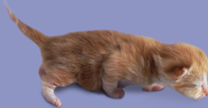
Four days old