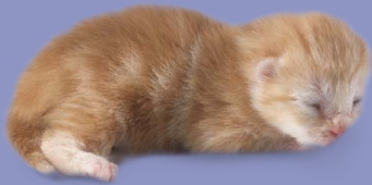
One day old