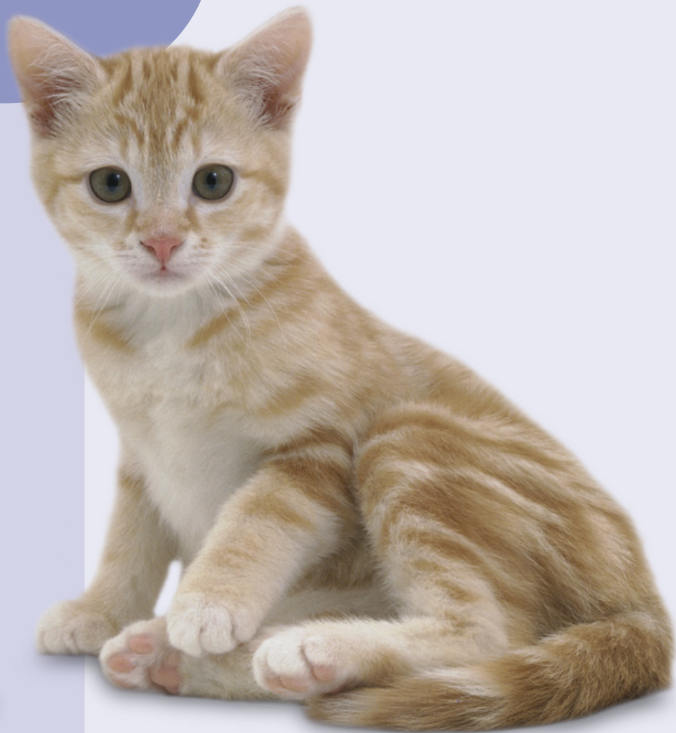
Ten weeks old