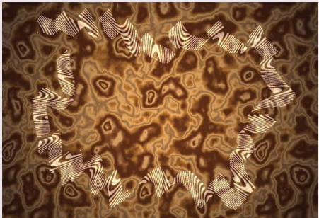
Delia Malchert, Scintillating scotoma, 2002. © 2004 Delia Malchert (http://www.migraene-aura.de/galerie/galerie/.htm, October 25, 2002)