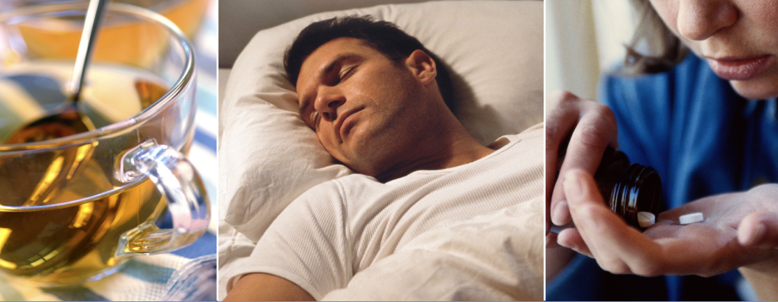
iont: Corbis: Rick Gomez br: Pinto/zefa bc: Getty Images: StockFood Creative bl. Back: Corbis: PhotoCuisine tl: Getty Images: Stone tc. tr

Don't let migraine headaches rule your life! This up-to-theminute resource will help migraine sufferers learn how to avoid attacks, diminish symptoms, and live life to the fullest.