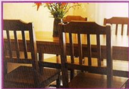
▲ tables and chairs