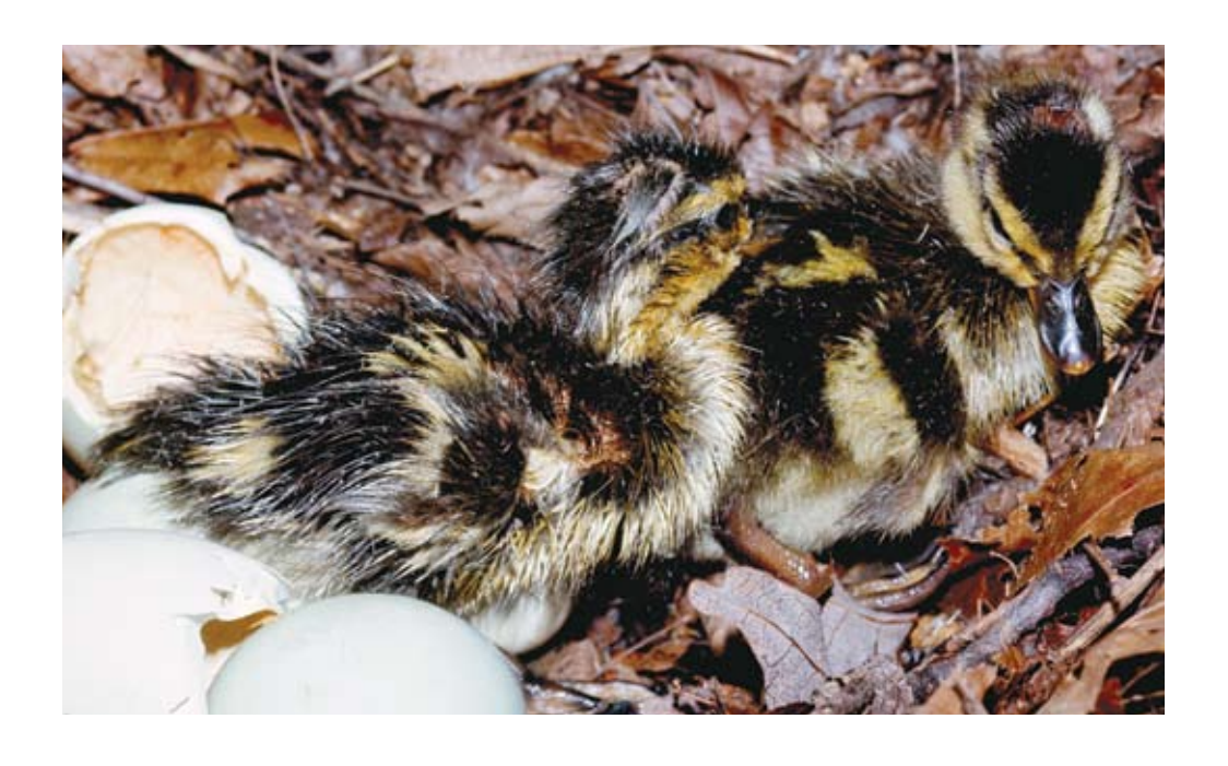
Crack! Crack! Crack! Baby ducks came out.