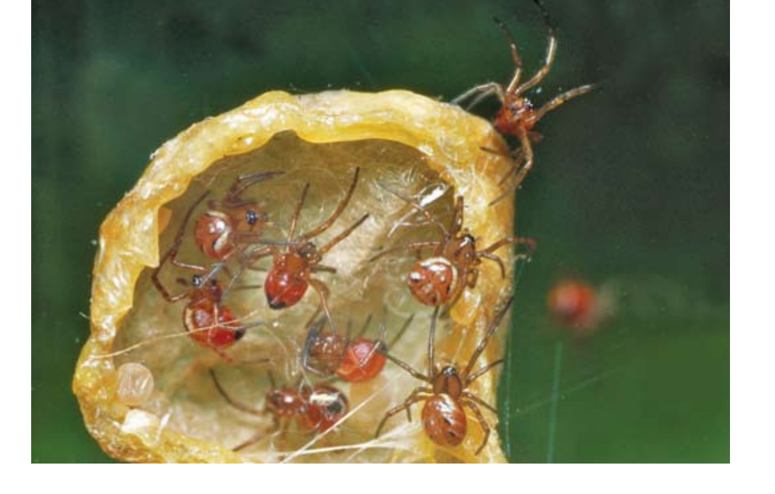
Pop! Pop! Pop! Baby spiders came out.