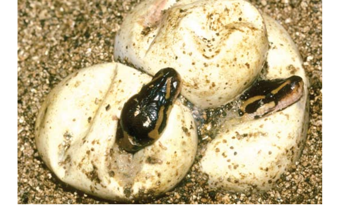
Crack! Crack! Crack! Baby snakes came out.