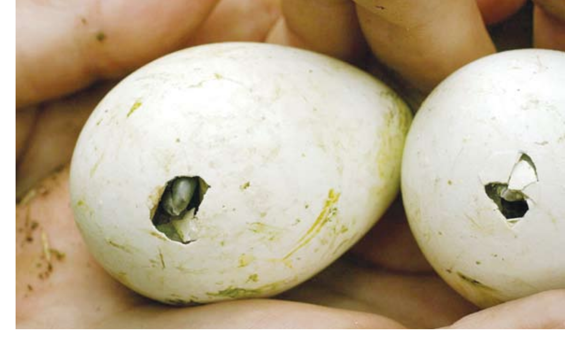
Crack! Crack! Crack! Baby penguins came out.