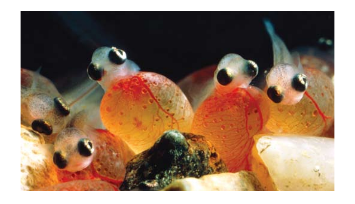
Pop! Pop! Pop! Baby fish came out.