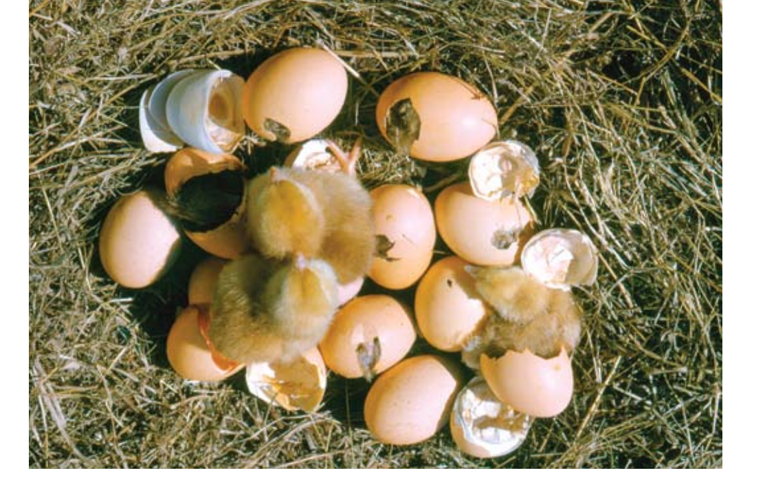
Crack! Crack! Crack! Baby chicks came out.