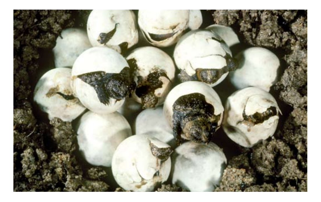
Crack! Crack! Crack! Baby turtles came out.