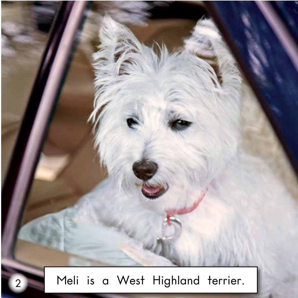
Meli is a West Highland terrier.