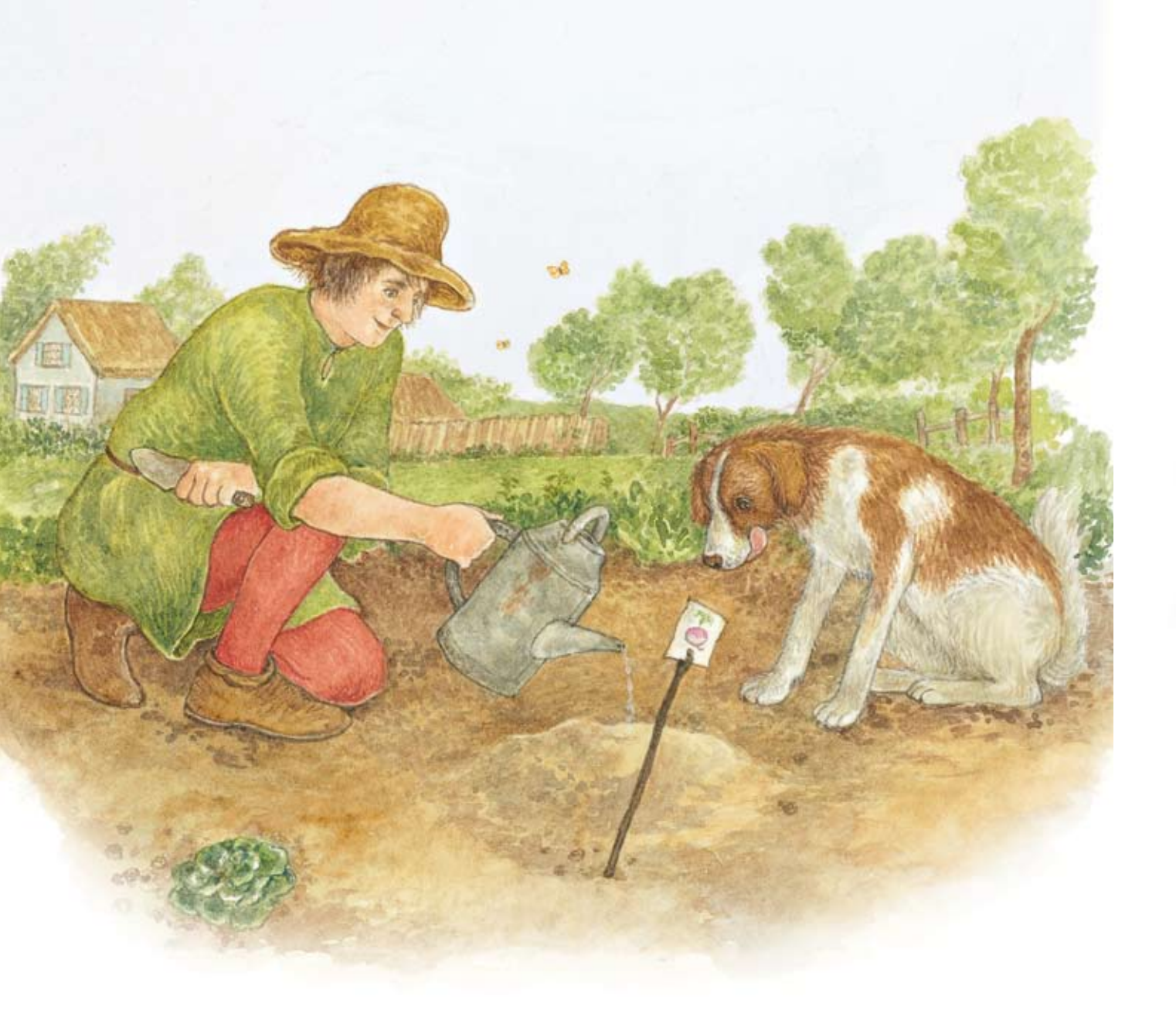
One day, a farmer planted a turnip seed. Then he went off to bed.

The seed grew all night. It grew and grew and grew!