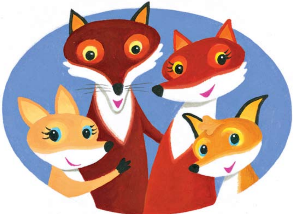
Roxy Father Mother Andy